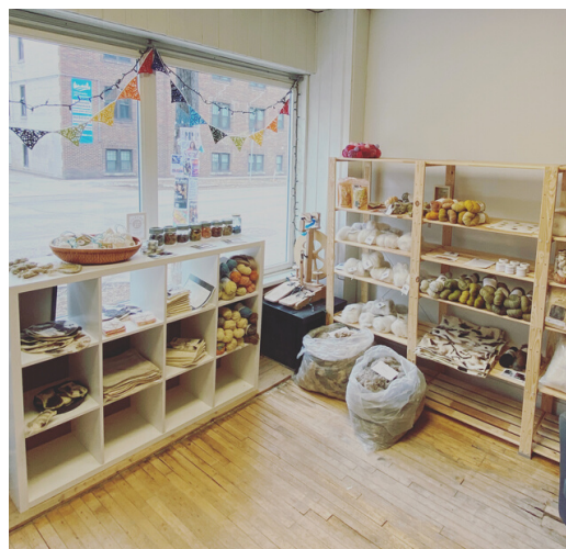
Producer Pop-Up Shop at Wolseley Wool

It is always a challenge to meet regularly with producers that are managing farms, mills, dye gardens, studios and more. We worked to connect individually with producers and use our networks to promote increased access to fibreshed products.