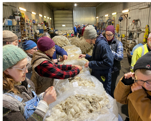
Wool Handling course in Brandon, MB