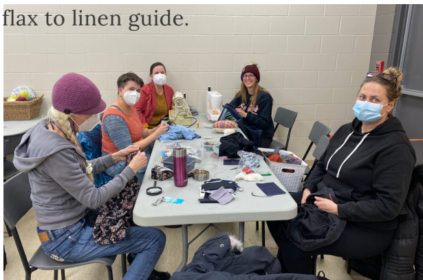
Community Mending Day - Winnipeg, MB

We redesigned some of our marketing and messaging material this year, including our product tags, informational postcard and created a new natural dye pamphlet. We also finished our online flax to linen guide.